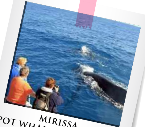
MIRISSA SPOT WHALES & DOLPHINS