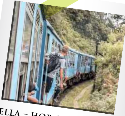
ELLA - HOP ON A TRAIN