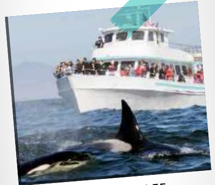
TRINCOMALEE CRUISE TRIP