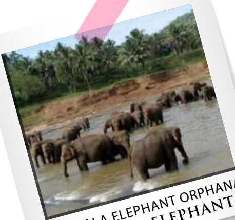
PINNAWALA ELEPHANT ORPHANAGE PLAY WITH ELEPHANTS