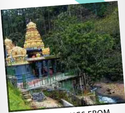
SEEK BLESSINGS FROM SEETHA AMMAN TEMPLE