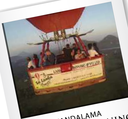
KANDALAMA HOT AIR BALLOONING